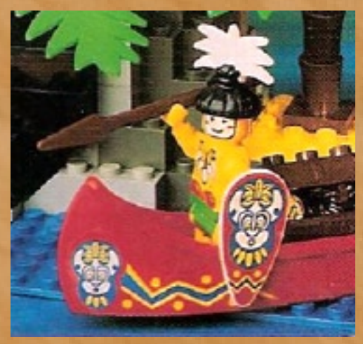
Behind the mask!