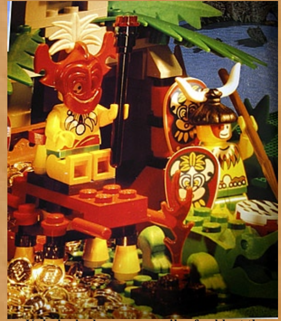
Kahuka had a genrous pile of gold at the base of his throne

They used this as a strategic advantage when reclaiming their treasure, knowing all to well that the covetous pirates would often abandon their crews to make off with the plunder. This created a perfect opportunity for the Islander to ambush the pirates when they came ashore to bury their treasure.