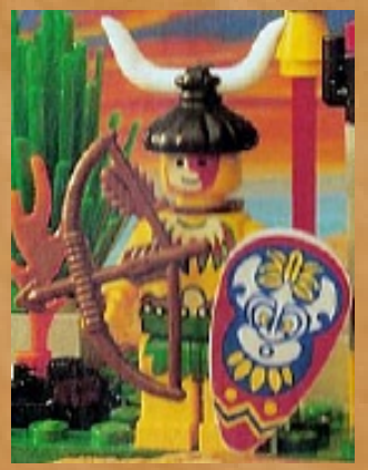
Pirates quiver at the sight of this arrow-packing Islander