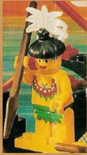
This is a kid's toy right?