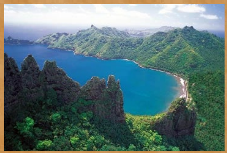
A typical backyard in Hawaiki

Eventually the two civilisations wiped each other out, quite literally, causing two entire continents to sink beneath the waves. This is why neither landmass exists today, but evidence of their existence can be found throughout many parts of the world.